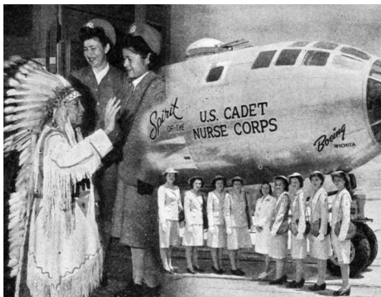
Cadet Nurses at the launching of the SS Nomad, the Spirit of the U.S. Cadet Nurse Corps, in 1945.